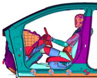
Fig.1 Sled FE model

The result of multiple linear regression analysis indicated that #3 chest rib has highest contribution to Rmax in both simulation conditions. From the simulation results, the mechanism of chest deflection change was considered in each case.